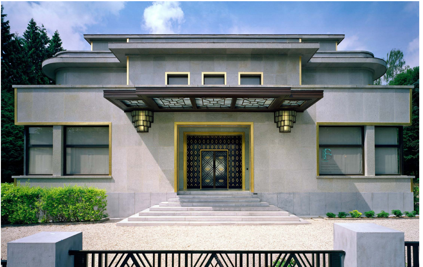
Villa Empain – Boghossian Foundation, Jean-Paul Remy © visit.brussels