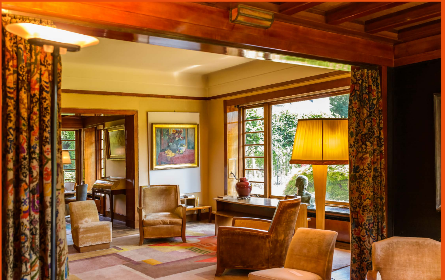
Van Buuren Museum & Gardens

The Brussels-Capital Region boasts a unique Art Deco heritage, as diverse as the tastes of the patrons of the time. Sometimes discreet, sometimes monumental – from intricately designed cornices on residential buildings to sprawling villas with swimming pools – the streets of Brussels are brimming with treasures waiting to be discovered or rediscovered.