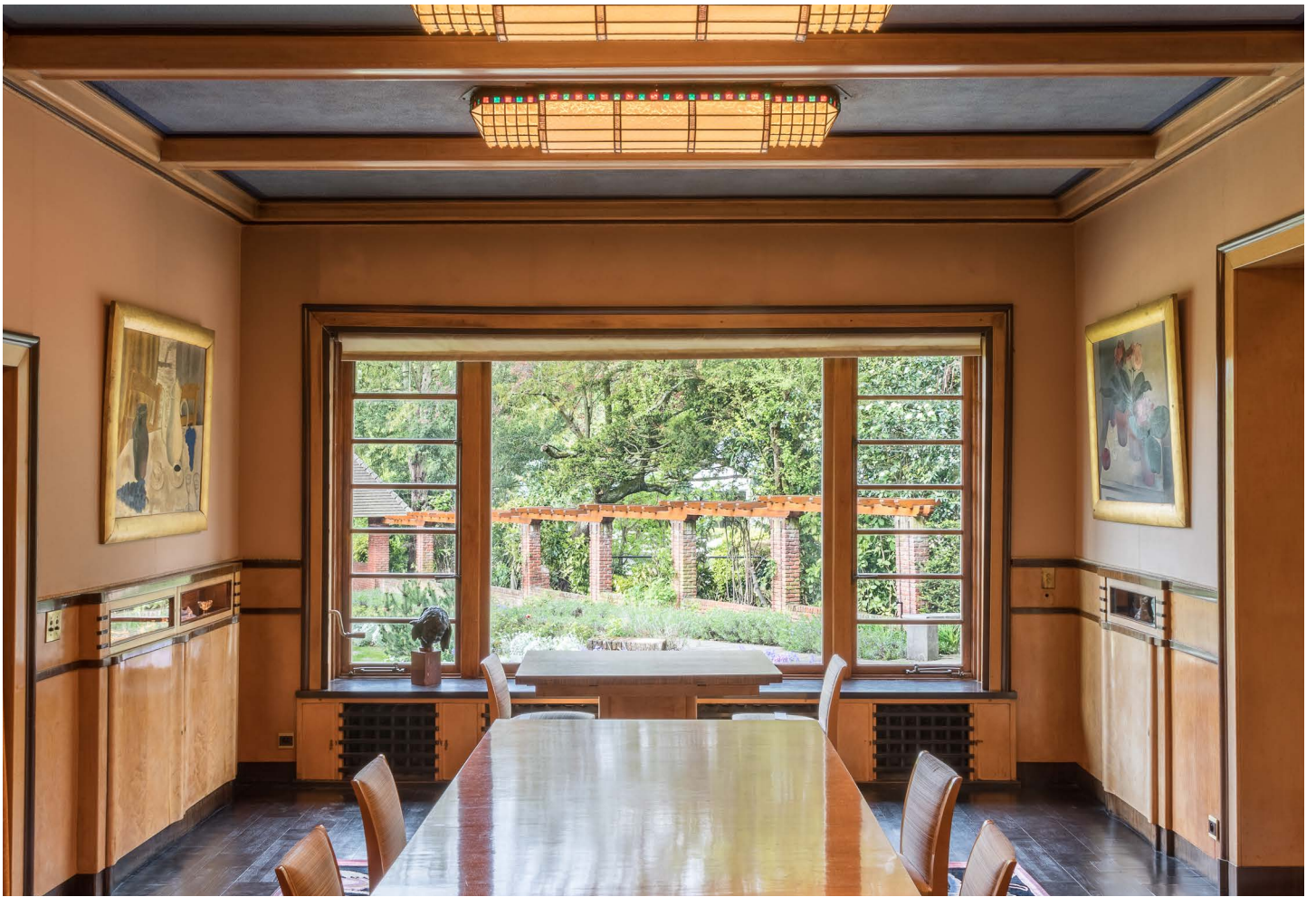
Van Buuren Museum & Gardens